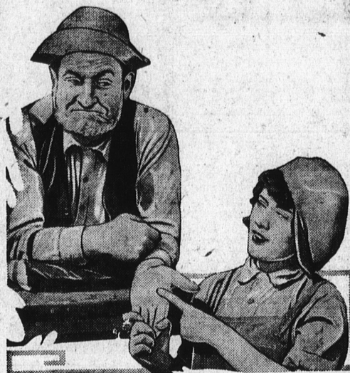
Sally O'Neill and Charlie Murray, in "MIKE"

A picture that abounds with the type of humor that amuses young and old alike is coming to the Torrance Theatre Thursday and Friday. It is Marshall Neilan's production of his own story, "Mike," and is a Metro-Goldwyn-Mayer picture. It is his third original story for the screen, the other two being "Minnie" and "Dinty."