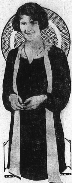
The new "skinny scarf" is merely the old-fashioned scarf cut longer and thinner to dingle-dangle from the collar. Cuffs to match the scarf are effective. The new ribbon scarf brightens up the darker street frock. It is worn here by Priscilla Dean.