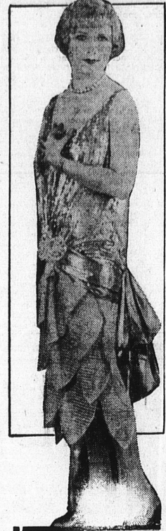
This evening gown is of gold paillette with silver points on the skirt, girdled with a gold tissue sash with innumerable loops of the same material across the back.