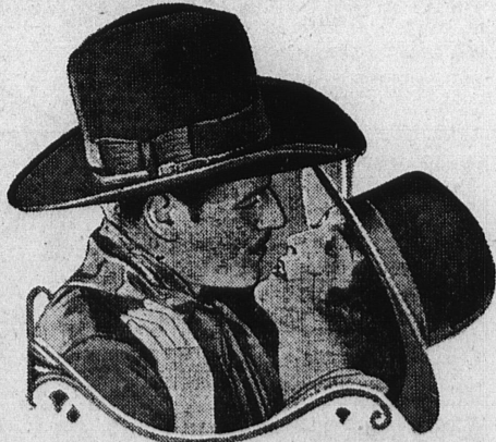
JACK HOLT AND BILLIE DOVE IN ZANE GREY'S "THE LIGHT OF WESTERN STARS" A PARAMOUNT PICTURE

Tonight, Thursday evening, and for one showing only at the Lomita Theatre, Evelyn Brent, crook actress of the screen, in "Smooth as Satin," and at 8:15 that hilarious farce comedy by the local post of the American Legion, "It Pays to Advertise," all local men and women. The price for this double program will be 50 cents for adults and 25 cents for children. You can not afford to miss this treat. The same cast in the same show without the picture program was shown at Torrance for 75 cents and $1.