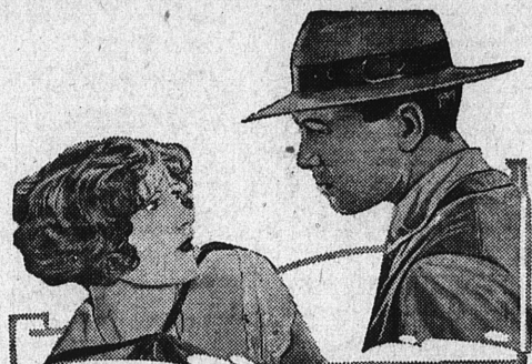
MARION DAVIES in "ZANDER THE GREAT"