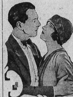
Percy Marmont and Alice Joyce in "DADDY'S GONE-A-HUNTING"

"Daddy's Gone a-Hunting" Well Worth Your While