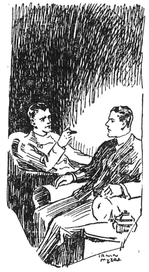
"Perhaps the Girl Killed Him."

"You say," I suggested, "that Slyke was killed about two o'clock in the morning. The girl might have come uncle's, and told the