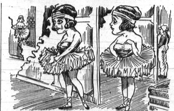
Miss Pfitt-My poor mother always was afraid I'd become an actress Miss Cutter-Well, I guess she feels grateful toward you, now that she