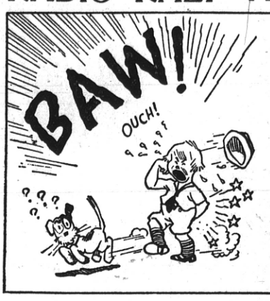
DADDY WAS DRIVING A NAIL AND HIT HIS FINGER A WHACK! WITH THE