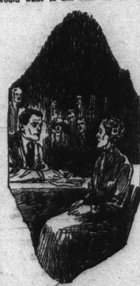
"Why Did You Think He Killed Him-

This seemed a harder question to answer than the other. "Why, I don't know. You see, he was shot; and I knew of no one who would want to kill him. As far as