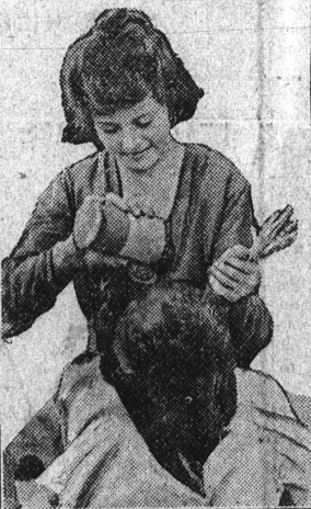
Dusting the Sitting Hen With Insect Powder.

put more than 10 eggs under a hen. Later in the spring, however, from 12 to 15 eggs can be set, according to the size of the hen.