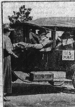
Improved Roads Facilitate the Delivery of Mail to the Farmer.

In 1920 in the state of New York alone the number of motorcars registered, including commercial vehicles,