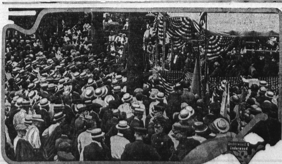
Growd Listening to the Late Senator Knox Deliver Independence Day Address, at Independence Hall, Last Year.

Constitution Into Effect in 1789. Constitution Into Effect in 1789. The federal Constitution was framed by the constitution convention which met in Philadelphia May 25, 1787, and adjourned September 17, 1787, and it went into effect March 4, 1789, having been ratified by eleven of the thirteen states, the others, North Carolina and Rhode Island, ratifying it November 21, 1789, and May 29, 1790, respectively.