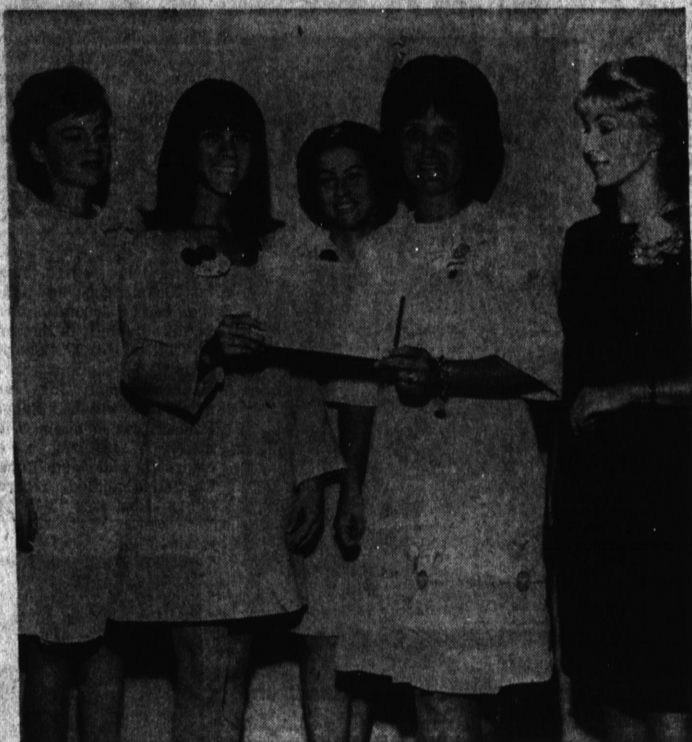
ASSIST FUTURE NURSES