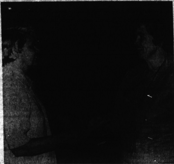
MOMENT OF ACHIEVEMENT