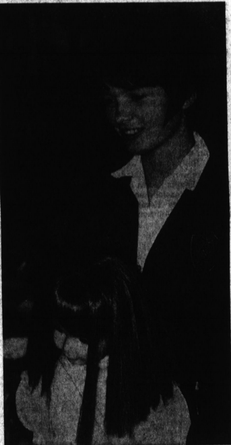
NEW JUNIOR PRESIDENT

Gifts were presented to the outgoing officers after which refreshments were served.