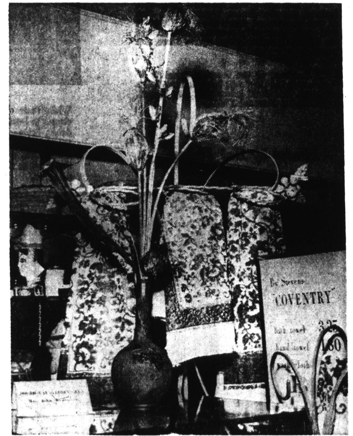
PRIZE WINNING ARRANGEMENT

meet July 13 and all officers are requested to wear their white formals as new candi-