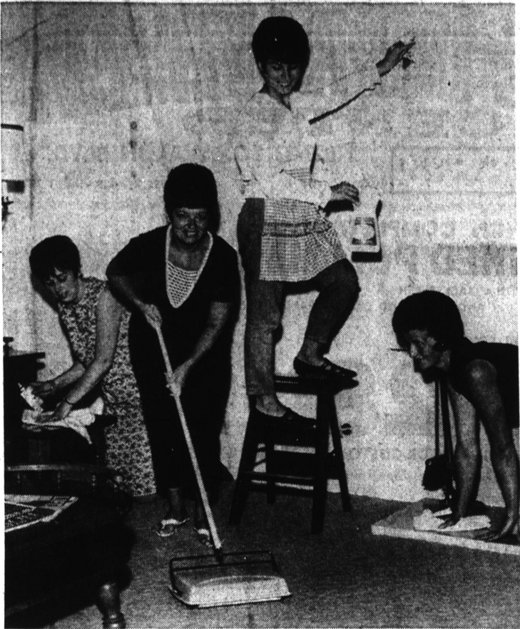
CLEARING THE DECK FOR THE NEW YEAR