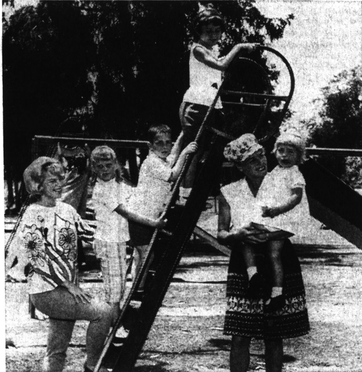
SUMMERTIME - AND THE LIVIN' IS EASY