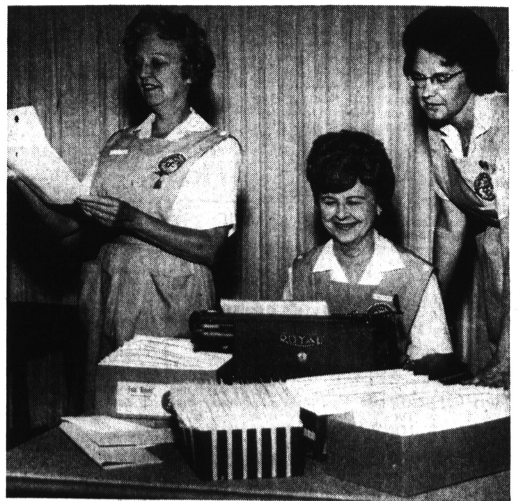
CALL FOR PATRONS