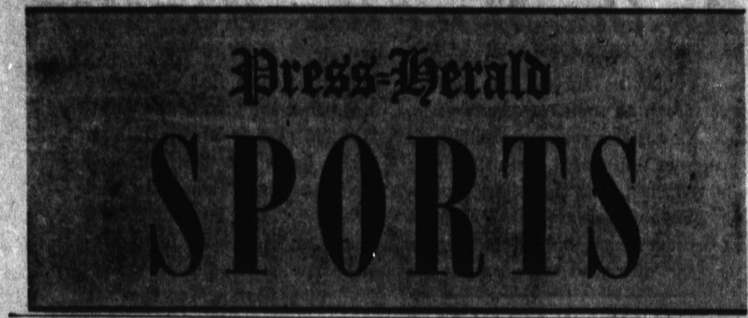
Press-Herald SPORTS A-6 JULY 2, 1967