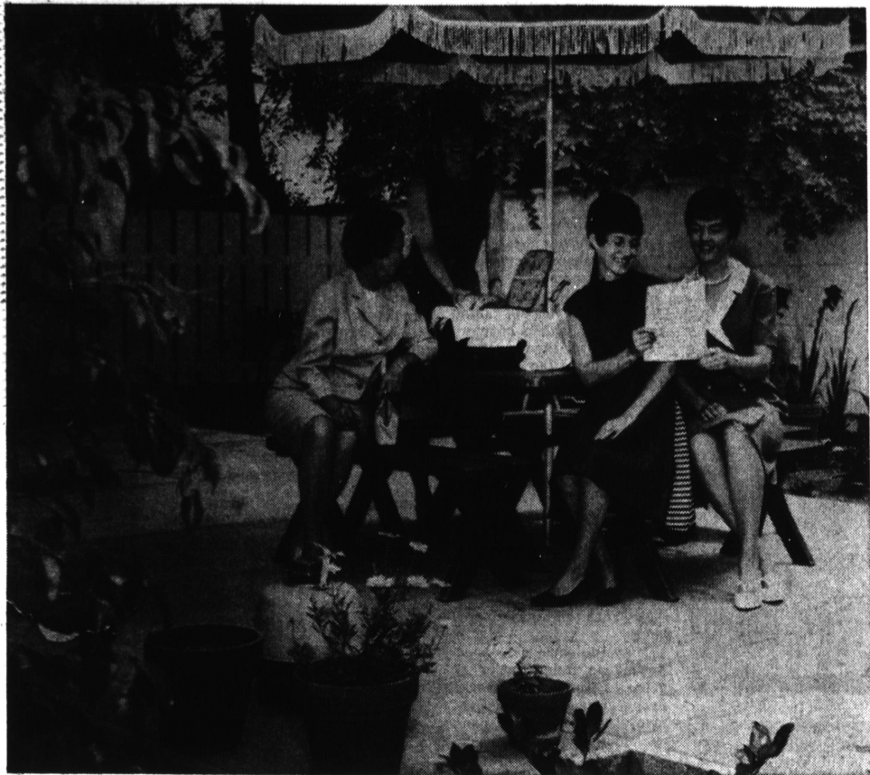
ANNUAL GREEK THEATER BENEFIT

Local Gamma Phi Betas are busy with their part in the Intercity Council's 13th annual benefit to be held Sunday evening when the group presents the opening night of the season, "Sweet Charity" starring Juliet Prowse and the Broadway cast. Gamma Phis are planning picnics on the grounds adjacent to the theater prior to the show. Charter buses will transport them to the theater. Preparing for the big