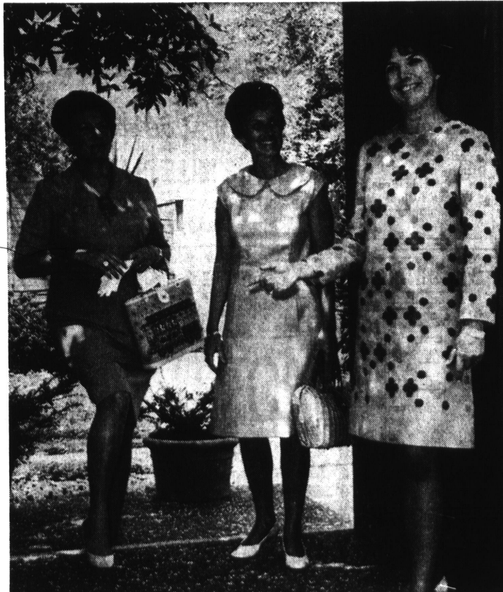
ROTARY ANNS PLAN FOOD CENTER TOUR

Her fiance is a graduate of South High and has served a tour of duty with the United States Navy.