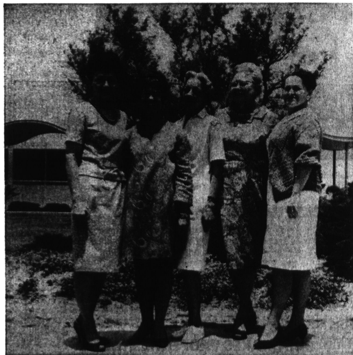
TAKE THE REINS