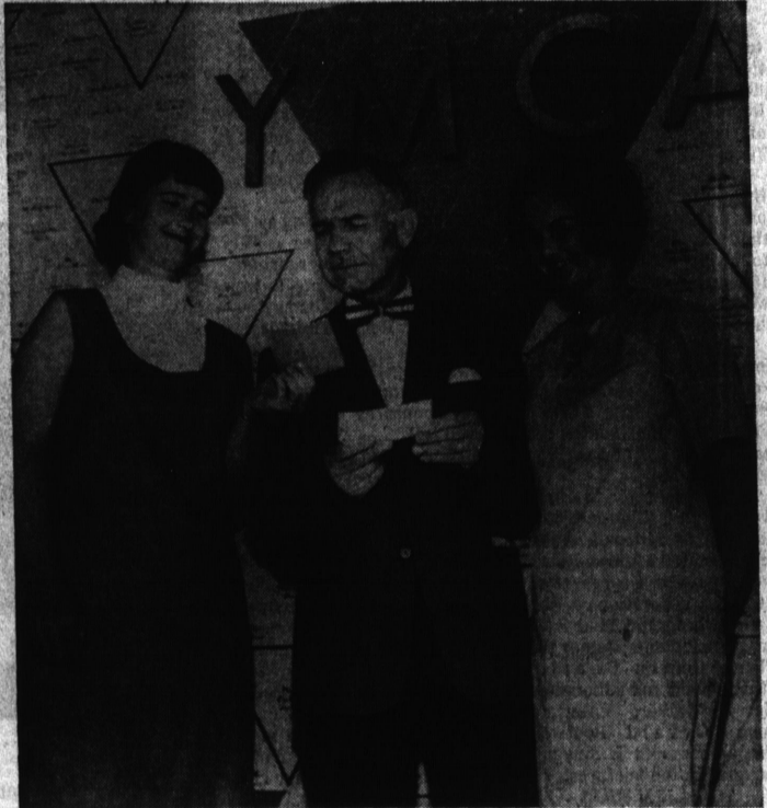
IT WON'T BOUNCE