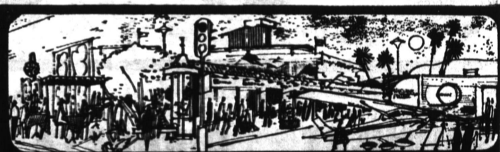
on the plaza of bullock's fashion square-torrance

FOR BEST CLASSIFIED ADVERTISING RESULTS — CALL DA 5-6060