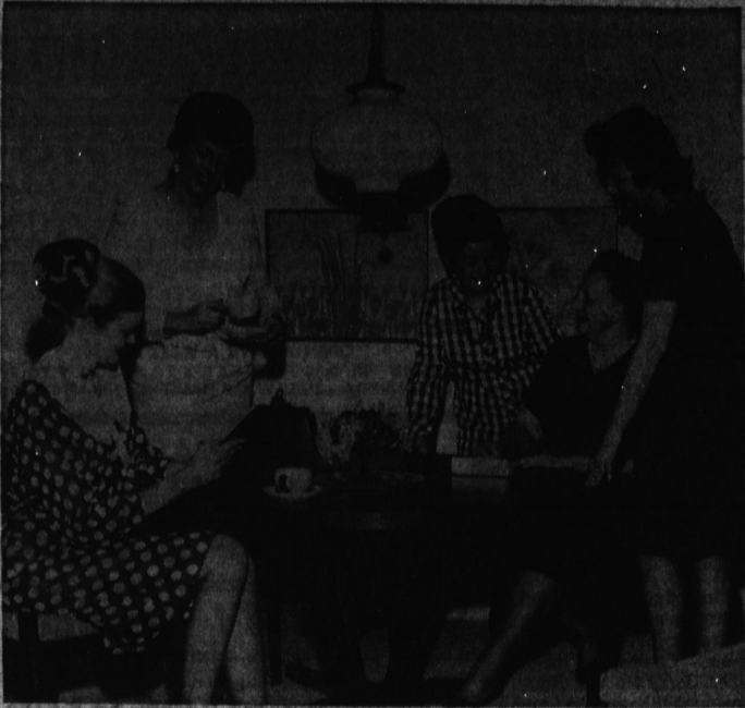
A LOOK TO THE FUTURE