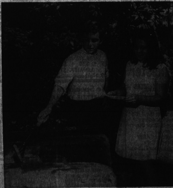
A REAL AMERICAN TREAT

The local chapter is made up of families who are interested in the program, whether or not they have directly participated by hosting students. However, any family interested in hosting a student or applying to send their son or daughter as an American Abroad should join the local chapter and prepare themselves for the experience. Family membership is only $5 per year, $10 is a patron membership; and $25 or more is (Continued on Page B-2)