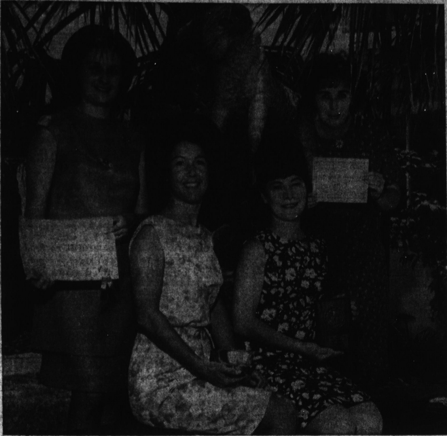
TIME FOR TAKING A BOW

Total contribution to youth projects in the Torrance Community during 1966-67 was $3800, according to Mrs. Taylor.