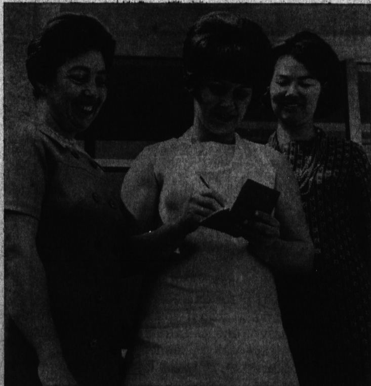
A CHECK FOR BUILDING FUND