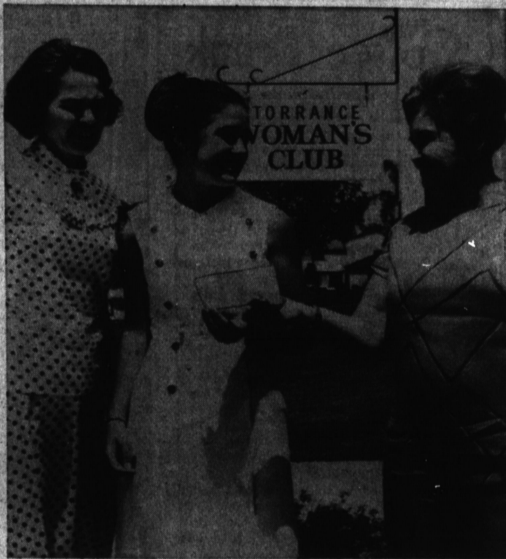
TORRANCE WOMAN'S CLUB

These new officers will be installed at the annual Jaycee - Jaycette Installation Dinner Dance at the Tasman Seas restaurant.