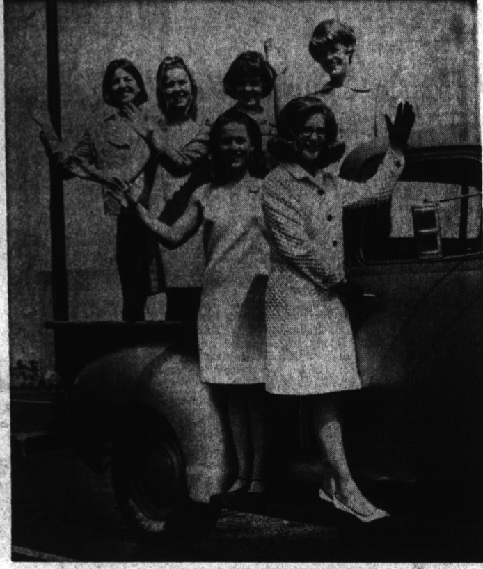
BOUND FOR GIRLS STATE

The functions and structure of city, county and state government is experienced by the girls attending Girls State in their program of learning-by-doing and in organizing sixteen mythical cities, four counties, the primary and general elections for electing state officials. The multipurpose of the Girls State program, sponsored nationwide by the American Legion Auxiliary, includes Americanism, education, community service and serves as a public relations tie with the community. The functions and struc