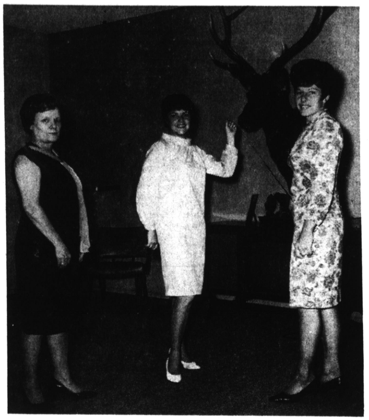
STEPPING INTO FASHION