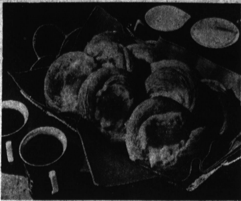
TASTE TREAT . . . Delicious pinwheel rolls covered with a cinnamon-sugar glaze are filled with a cream cheese mixture topped with pineapple jam. The rolls can be made in short time with Bridgford frozen ready to bake bread dough.

Mix together 2 tablespoons sugar and 2 teaspoons flour. Add remaining ingredients except jam. Place a rounded teaspoon of mixture in the center of each roll. Spoon 1 teaspoon of jam in the center of cheese mixture. Let rolls rise in a warm place (90 Degrees F. to 150 Degrees F.) until doubled. Bake 375 Degrees F. about 15 minutes. Cool on rack. Yield: 16 rolls.