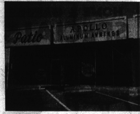
PATIO CENTER... Aluminum awnings are being featured at the Apollo Patio Center at 3125 W. Rose-crans Ave., Hawthorne, Aluminum is light weight and is one of the most corrosion resistant metals new available, Apollo features a complete line of