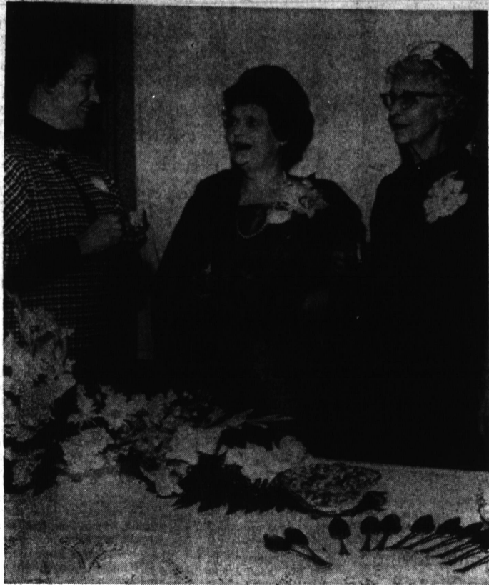
A PRESIDENTIAL WELCOME