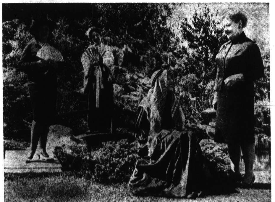
FLOWERS OF THE WORLD

Guests are invited to attend the affair and should notify one of the hostesses.