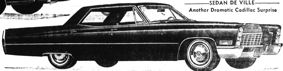
SEDAN DE VILLE Another Dramatic Cadillac Surprise

Buy or Lease Your 1967 Cadillacs From Ronald E. Moran Cadillac